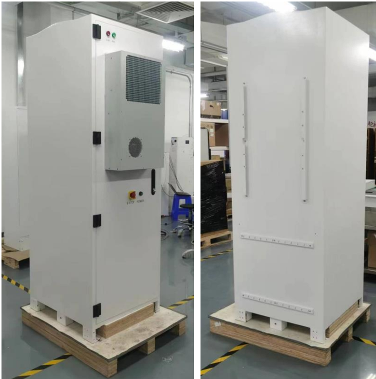
Battery(CIESS 60 614,4V 100Ah 60kWh)