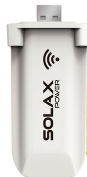
3rd Gen X-Hybrid