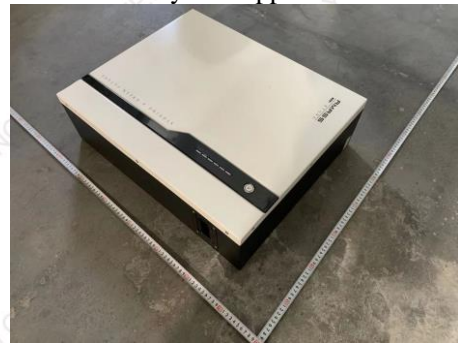
电池侧面外观 Battery side appearance