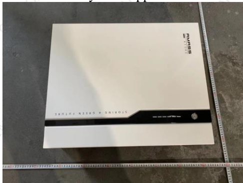
电池正面外观 Battery front appearance